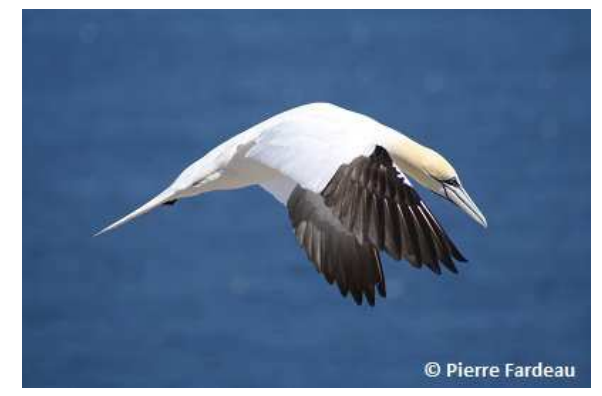
5 Northern Gannet

As well as underwater swimming, many seabirds, such as storm-petrels, terns, and jaegers, feed at the sea surface, seizing prey in flight. Others, including kittiwakes, phalaropes, and Northern Fulmars, feed while sitting on the water. Species such as gannets, boobies, pelicans, and terns use the impetus derived from plunging vertically into the sea to carry them underwater. Gannets dive from heights of up to 50 m above the surface to reach depths of as much as 15 m. However, most seabirds feed within 1-2 m of the sea surface, gleaning floating material, or feeding on organisms swimming at very shallow depths. Differences in feeding techniques have led to a variety of seabird designs. The following drawing shows the