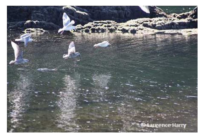
6 Herring Gulls feeding

Most seabirds feed either on small fishes or on zooplankton, the small, mainly crustacean, or shelledorganisms that browse the oceans' primary producers, the microscopic plants called phytoplankton. Seabirds tend to be generalized in their diet, taking a wide spectrum of different sizes and types of prey. However, while rearing chicks they are more selective. Murres and puffins, for instance, take a very diverse diet, but feed their chicks exclusively on fish. In some situations a particular species of fish may become dominant in the diet. In the northwest Atlantic, for instance, the capelin, a small schooling smelt, is important to most seabirds, as well as to cod and marine mammals. In the Arctic, the Arctic cod,