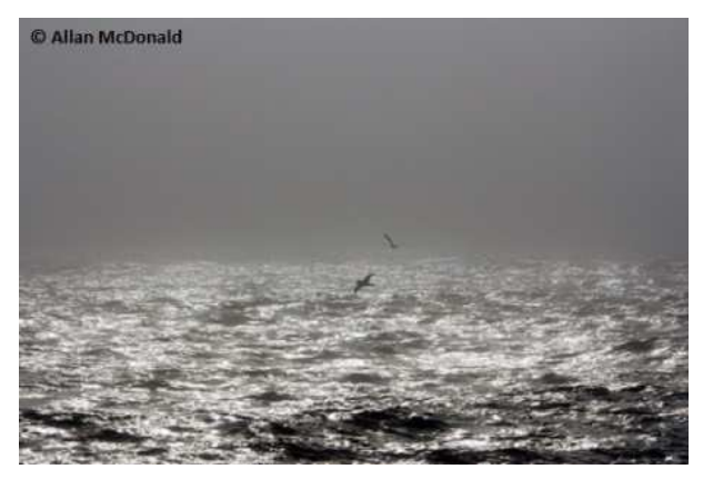
3 Sooty Shearwaters

True seabirds – those that spend all their lives at sea except when breeding – are among the most far-ranging of all birds. For example, Northern Fulmars in the Canadian high Arctic may travel more than 500 km from their breeding colony to find food during the breeding season, while the foraging trips of large albatrosses may cover several thousand kilometers. Oceanic seabirds are amazingly unaffected by storms and waves. The large albatrosses are actually dependent on strong winds to allow them to glide the enormous distances that they need to cover in order to find their food. However, a prolonged period of adverse weather conditions, especially in winter, can exhaust the energy reserves of some birds, resulting in their being