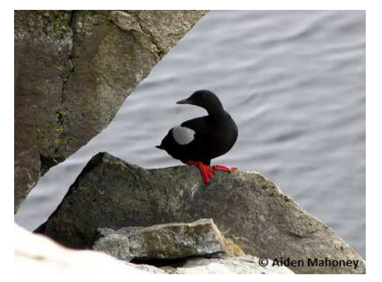
11 Black Guillemot

The kittiwake, puffin, and murre colonies on islands in Witless Bay