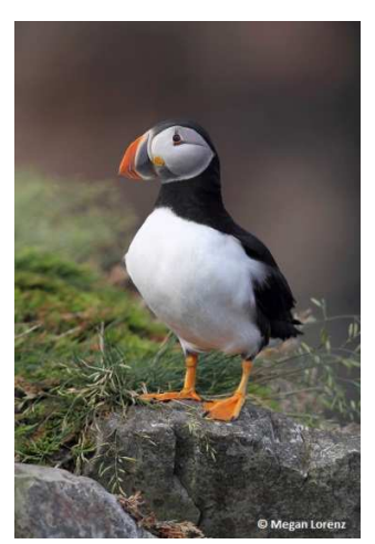
12 Atlantic Puffin

respectively, Bay Bulls and Witless Bay, just south of St. John's, and Bay de Verde at the north end of Conception Bay. At the tip of the Gaspé Peninsula, in Quebec, the Northern Gannet and murre colony at Bonaventure Island can be reached by regular tour boats from Percé. Whether seen from the land or from a boat cruising below the cliffs, this gannetry is truly awe-inspiring.