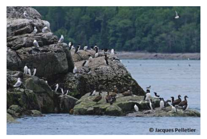
4 Several species of seabirds in a colony

washed up exhausted on beaches, or even driven far inland. Certain species are famous for such periodic "wrecks." In eastern North America showers of Dovekies appear inland at irregular intervals, apparently as a result of an adverse combination of strong winds and poor food supplies.