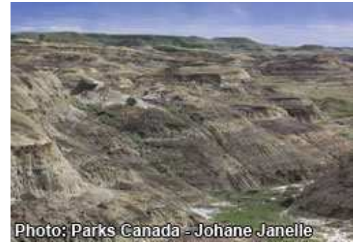
1 Badlands in the East Block portion of Grasslands National Park, Sask.

Tropical Sannavahs , found in Africa, Australia, South America, and Indonesia, stay warm all year. They receive 50 to 130 centimetres during the rainy season (6 to 8 months), and endure drought for the remainder of the year. Plant and animal species vary greatly across the Savannah, curbed by differences in climate, but much of the Savannah is characterized by thin soil where only grasses and flowering plants can grow. Like Canada's grasslands, this ecosystem supports an astonishing diversity of species; the African savanna, for example, is home to some of the world's most iconic mammals, including giraffes, zebras, and lions.