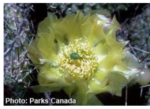
3 A prickly pear cactus in Grasslands National Park, Sask.

There are also small but significant steps that private individuals can follow to help restore and preserve Canada's remaining grasslands, as well as other critical habitats. These are just a few suggestions for encouraging a healthy habitat, no matter where you live in Canada: