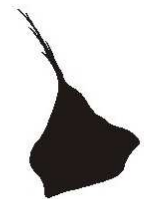
Ear of Canada lynx

Of the three Canadian members of the cat family (Felidae)—the lynx, the bobcat, and the cougar—the lynx and the bobcat are most alike and are most closely related to each other. They probably both descended from the larger Eurasian lynx. There are small differences in appearance: on average, bobcats are slightly smaller; the bobcat's feet are not as large as those of the lynx, making the bobcat less able to secure food in deep snow; the lynx's tail has a solid black tip, whereas that of the bobcat has three or four narrow black bars and a black spot near the tip on its upper surface; and the bobcat's fur has more pronounced spotting. The cougar is much larger and more powerful than either of them, and can be readily identified by its long tail.