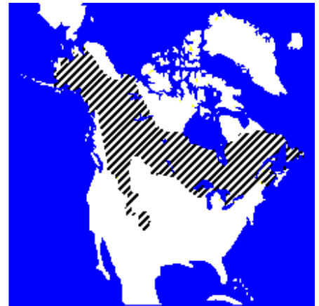
/// Distribution of the Canada lynx

The range of the lynx is essentially that part of North America covered by boreal, or northernmost, forest and occupied also by the snowshoe hare. Between 1900 and the mid-1950s, lynxes became scarce in the southern portions of this range. This was probably due to trapping during periods of snowshoe hare scarcity (low years in the 10-year cycle). At these times lynx numbers are already low and fewer young are surviving to adulthood, so trapping can seriously deplete, or even eradicate, local populations. In the past 25 years, lynxes have reoccupied some of this southern range, and this may be due to tighter legal restrictions on trapping. The northern range expansion of the bobcat in the past century may also have contributed to the overall decline in lynx numbers. When both species compete for the same space and food resources, the lynx most often yields to the more aggressive and adaptable bobcat.