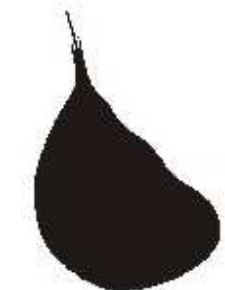
Ear of bobcat