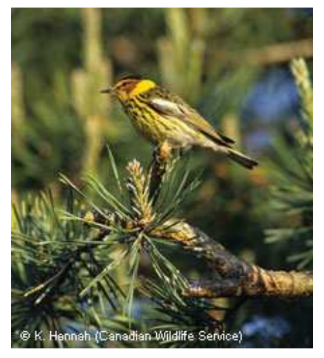
6 Cape May Warbler

Many of the birds that we see in our communities have bred in the boreal forest or passed through it travelling north or south, and many of these are the singers of the forests—small birds such as warblers, vireos, thrushes, kinglets, grosbeaks, sparrows, and flycatchers—which are hard to see but wonderful to hear. Ducks, loons, grebes, rails, gulls, kingfishers, and cranes depend on Canada's boreal waters for nesting