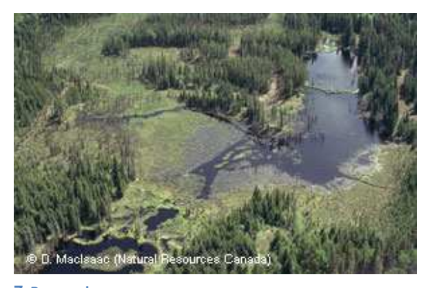
7 Beaver dams

Of these, the snowshoe hare is the most ecologically important. It is a food source for many of the boreal forest's predators (both mammals and birds) and feeds on the forest's various plants and shrubs, linking all of these species in a tight food web.